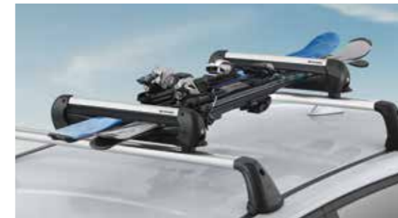
Ski & snowboard carrier 400