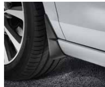
Mudguard kit, front