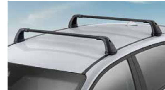
Roof rack, steel