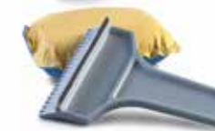
Winter car care kit