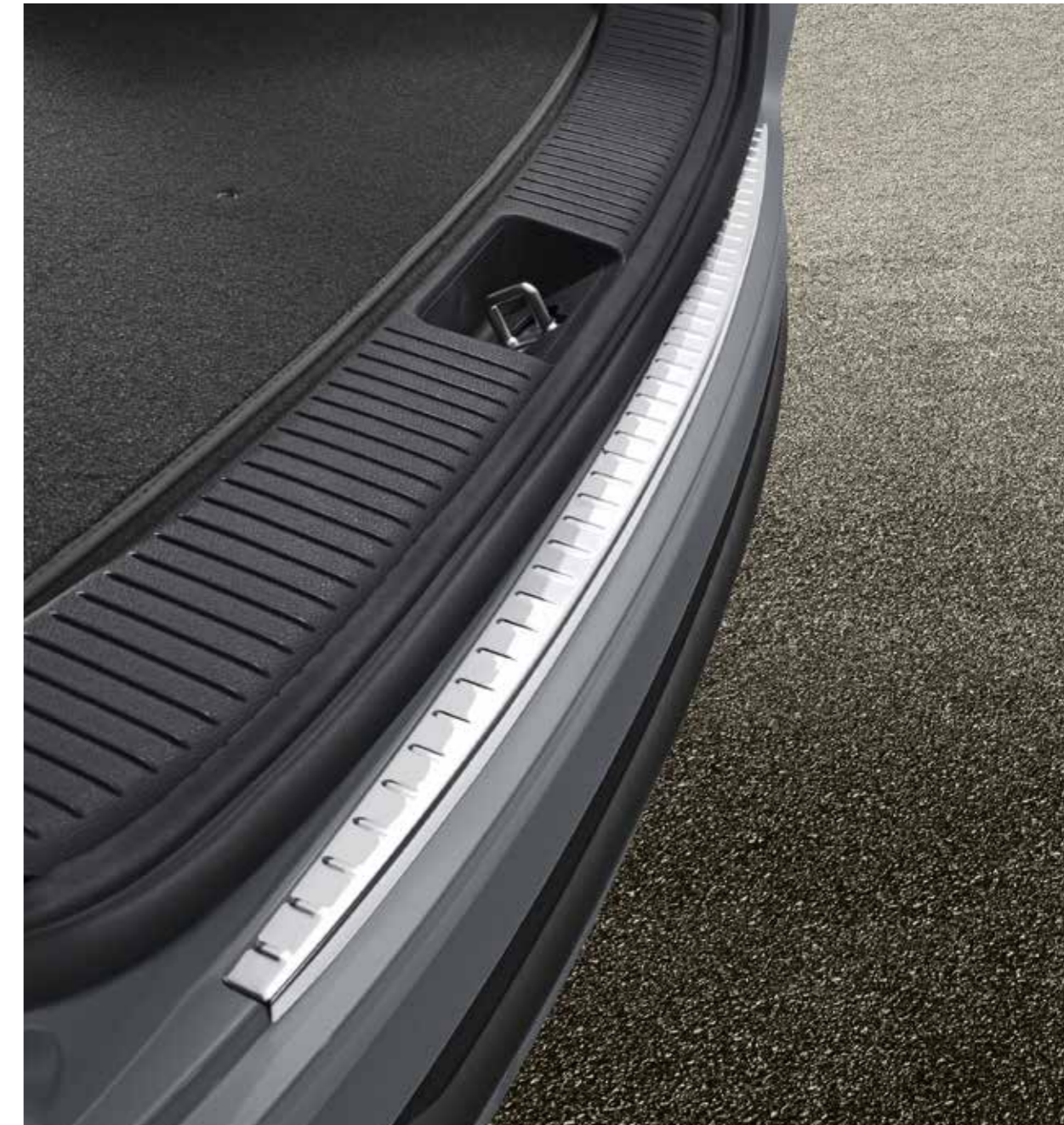
Rear bumper protector