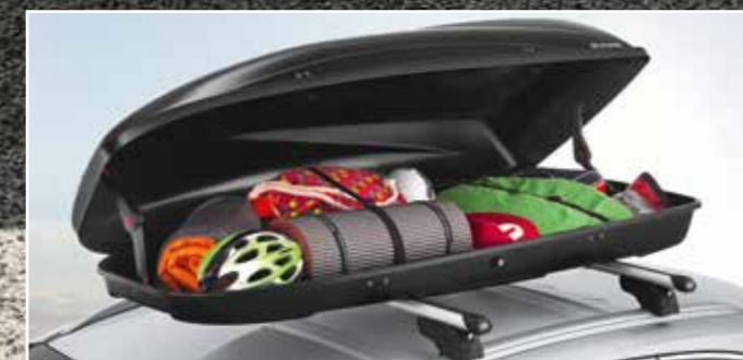
Roof box 330