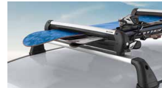
Ski & snowboard carrier 600