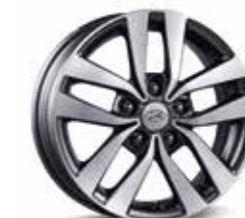
Alloy wheel 16"