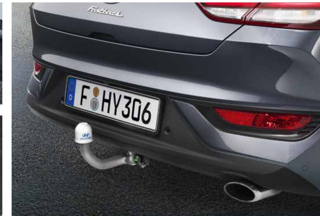
Tow bar, detachable

Maximum towing load capacity will depend on your car's specification. Please consult your dealer for further information. All Hyundai i30 Genuine tow bars are corrosion resistant, certified by ISO 9227NSS salt spray test, and comply with OE Car Loading Standard (CARLOS) – Trailer Coupling (TC) and Bike Carrier (BC) requirements.