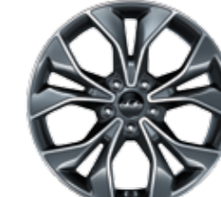
Alloy wheel 18"