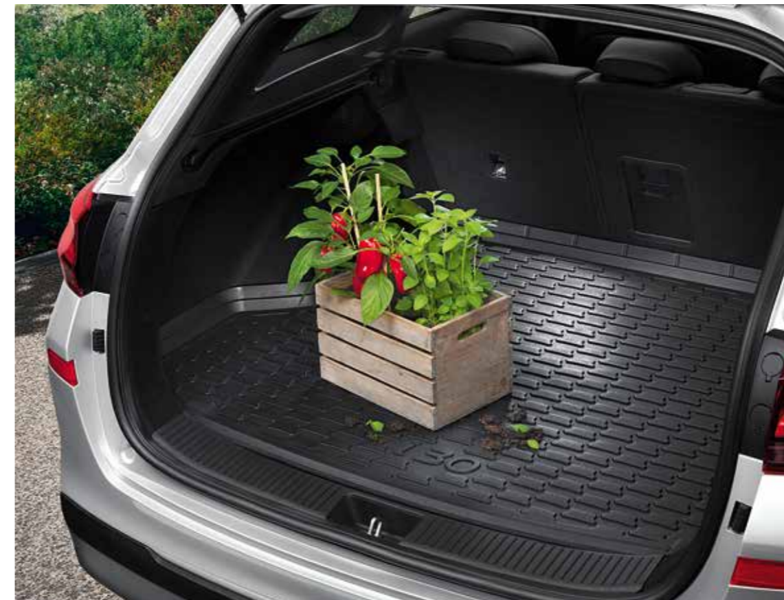
Trunk liner (Wagon)