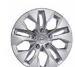
Steel wheel cover 15"