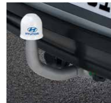
Tow bar, detachable