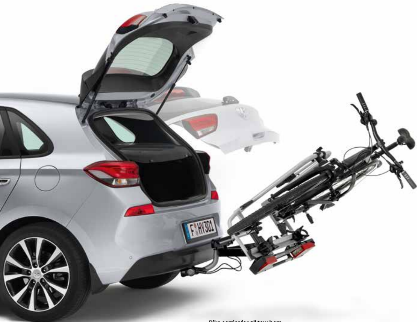
Bike carrier for all tow bars

Sturdy accessories that make it so easy to carry your lifestyle with you on all your adventures.