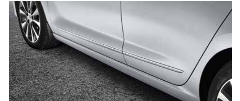
Side trim lines