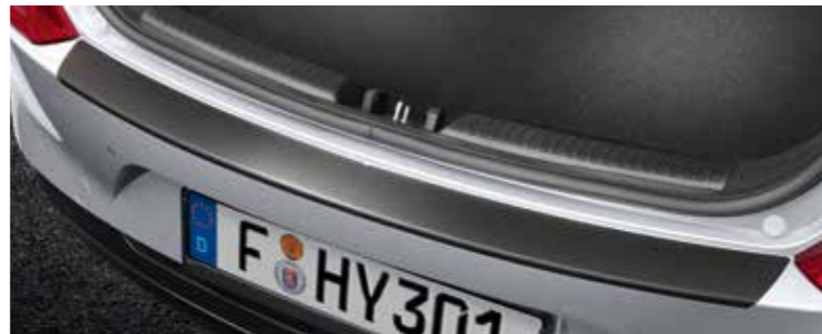
Rear bumper protection foil, black (5dr)