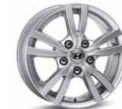
Alloy wheel 15" Asan