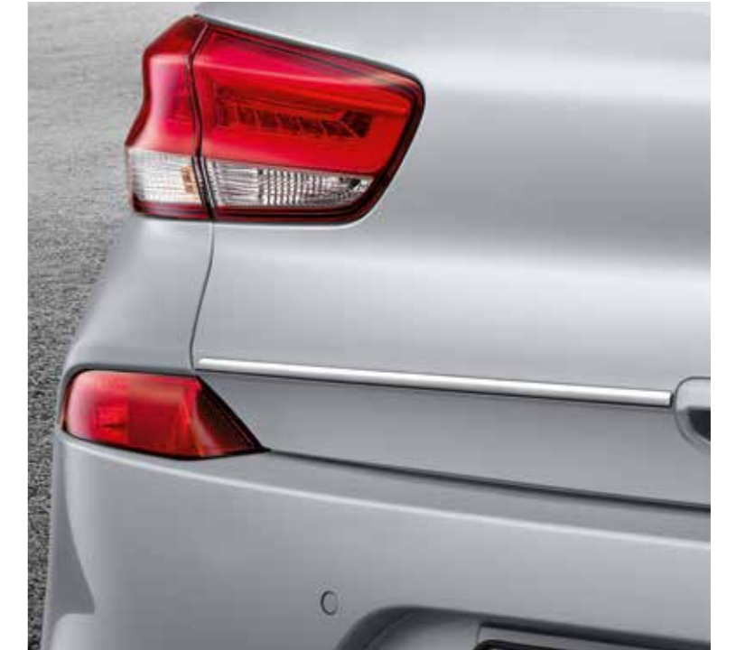
Tailgate trim line (5dr)