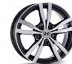
Alloy wheel 16" Asan