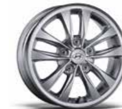
Alloy wheel 15"

Make safety and driving efficiency a top priority, with genuine sensors for optimum tyre functionality. The TPMS kit lets you monitor air pressure levels in your tyres at all times. F2F40AK990 (not shown)