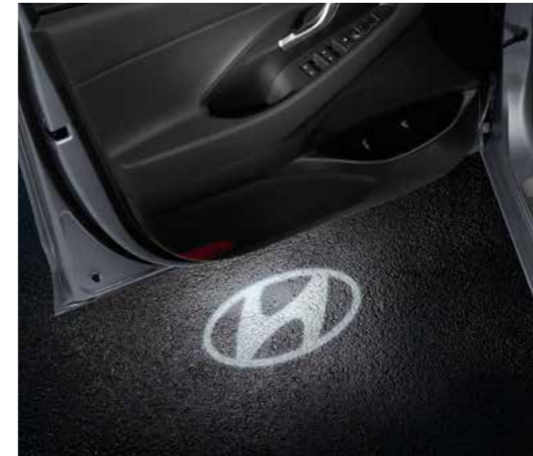
LED door projectors, Hyundai logo