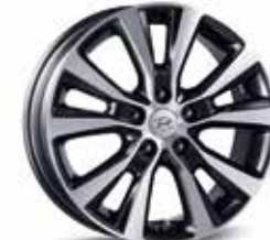
Alloy wheel 17"