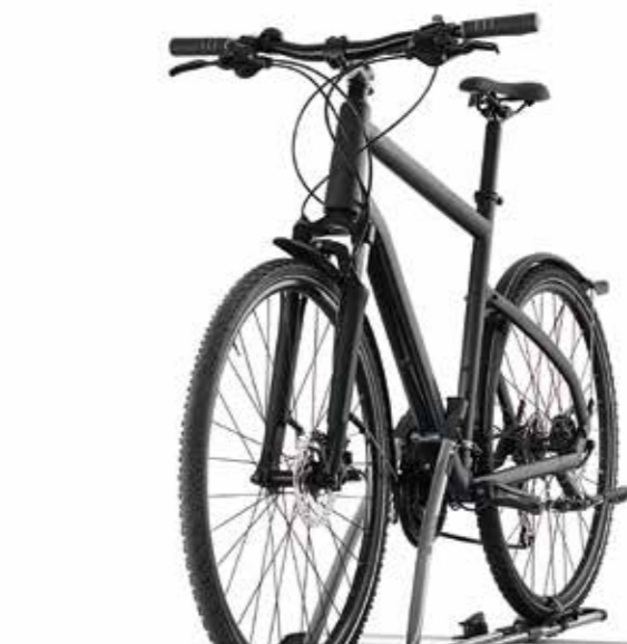
Bike carrier Active