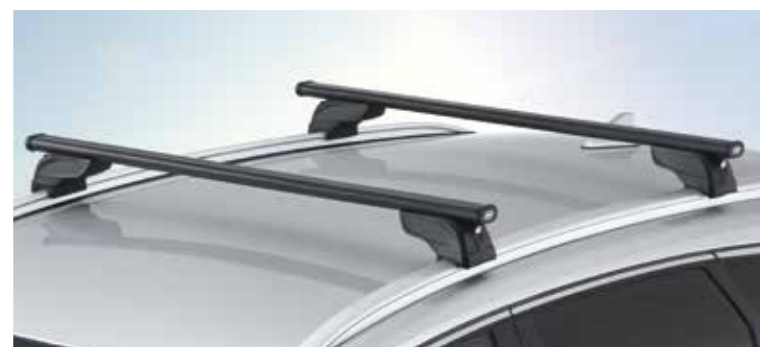
Cross bars, steel