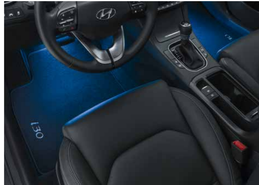
LED footwell illumination, blue, first row