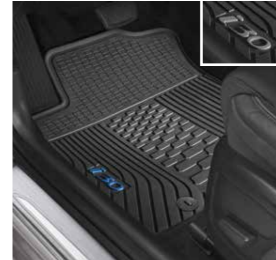
All weather mats, with colour accent

Keeping your new i30 clean and tidy will also help preserve its value and good looks.