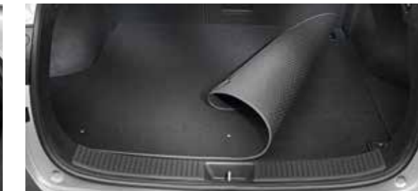
Trunk mat, reversible (Wagon)