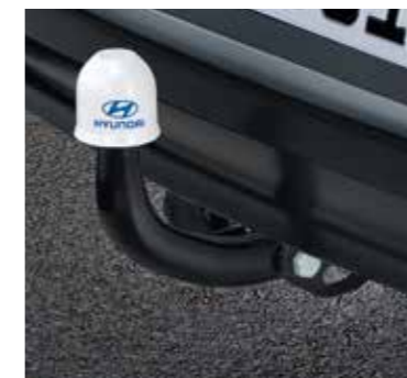
Tow bar, fixed

G4280ADE10 (Wagon / application only for vehicles without OE rear park distance control)