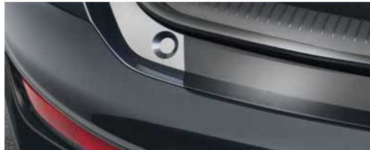
Rear bumper protection foil, black (Fastback)