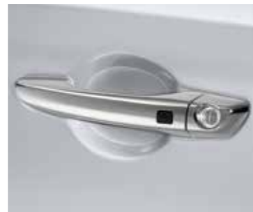
Door handle recess protection foil