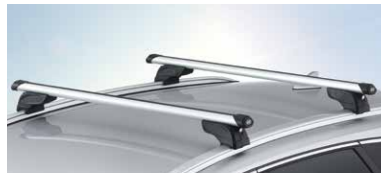
Cross bars, aluminium