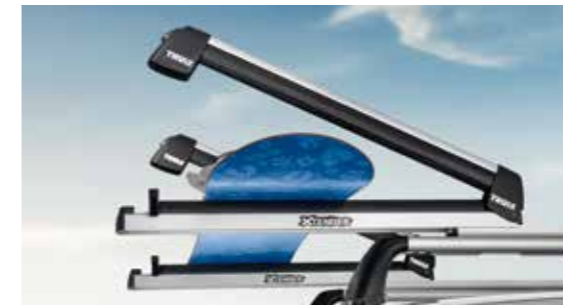
Xtender ski & snowboard carrier