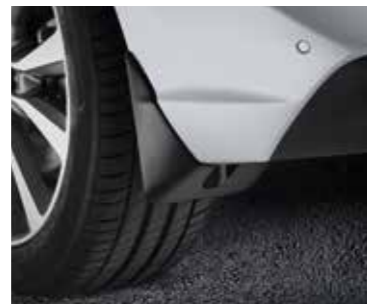
Mudguard kit, rear