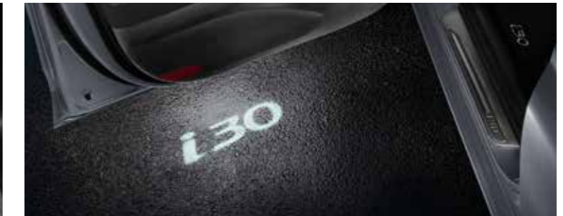
LED door projectors, i30 logo

99651ADE99 (additional cable kit for vehicles without smart key)