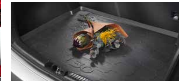
Trunk liner (5dr)