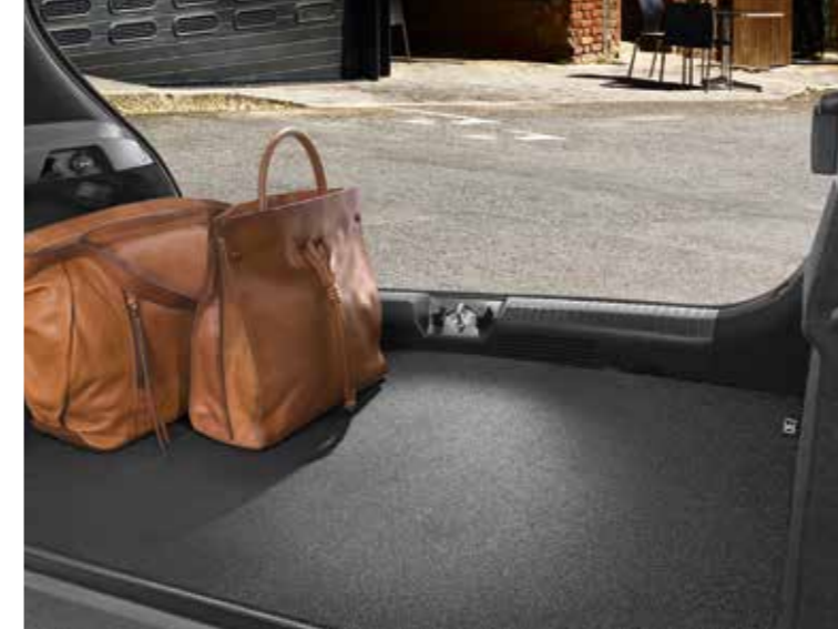
Trunk mat (5dr)

Trunk liner From gardening tools to family pets - some cargo can be potentially wet or grimy. This durable, anti-slip and waterproof liner with raised edges will keep your trunk clean nonetheless. With a textured anti-slip surface to prevent loads moving around. Made-to-measure for the i30. G4122ADE00 (5dr, for vehicles with luggage undertray) G4122ADE10 (5dr, for vehicles without luggage undertray) G4122ADE20 (Wagon MY 17) G4122ADE21 (Wagon MY 18)