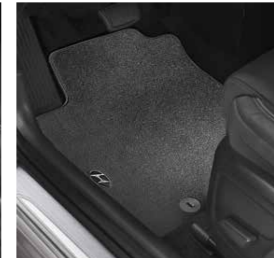
Textile floor mats, premium