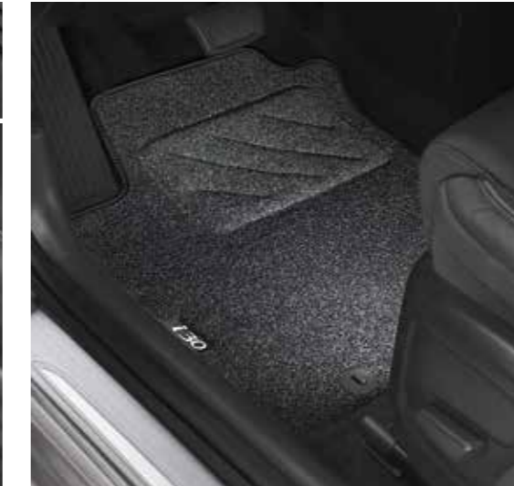
Textile floor mats, standard