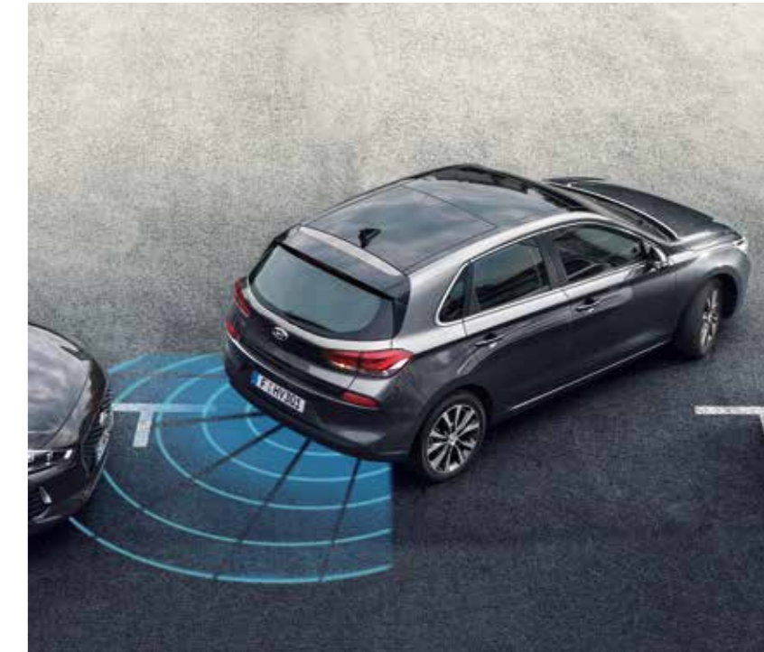
Park distance control, rear