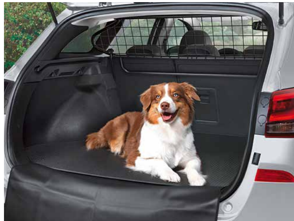
Cargo separator, upper frame