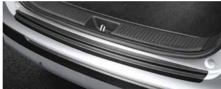
Rear bumper protection foil, black (Wagon)