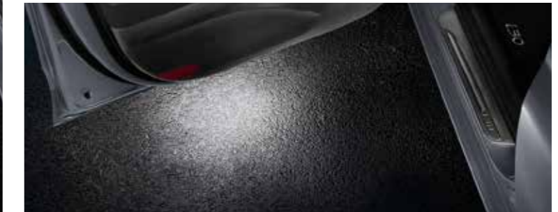
LED puddle lights