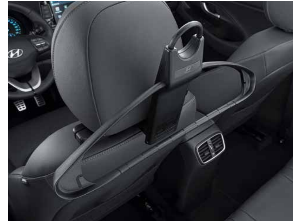
Business suit hanger