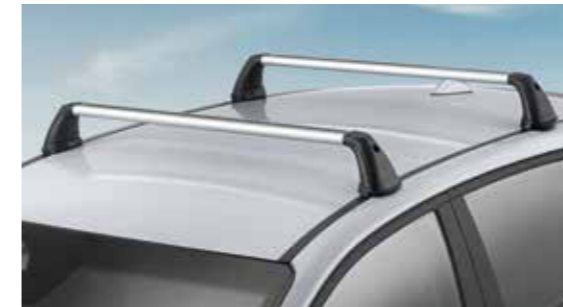
Roof rack, aluminium

99701ADE90 (U-mount adapter kit for steel roof racks / steel cross bars)