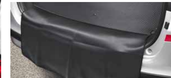
Bumper flap for trunk mat, reversible (Wagon)