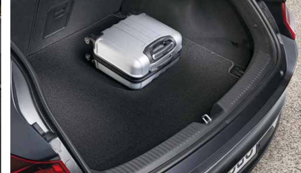
Trunk mat, reversible (Fastback)