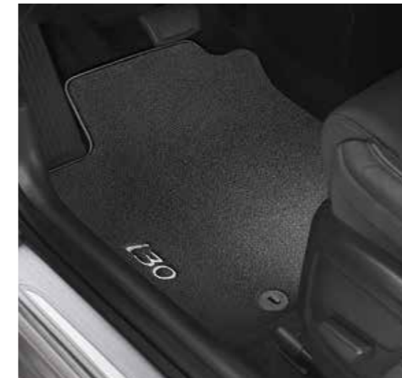
Textile floor mats, velour