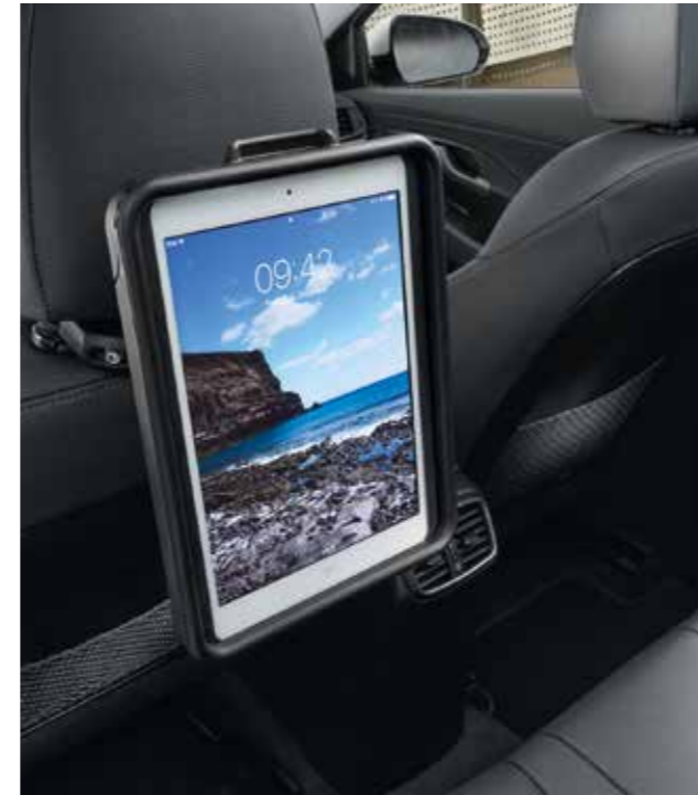
Rear seat entertainment cradle for iPad®