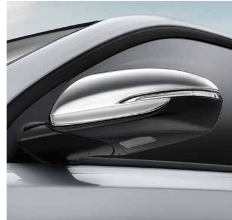
Door mirror caps

The elegant high gloss stainless rear bumper protector on page 29 harmoniously complements these bright styling elements.