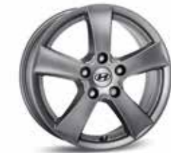
Alloy wheel 15" Mabuk Alloy wheel 16" Mabuk