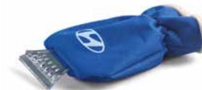
Ice scraper with glove

LP982APE1BROH (bronze pack) LP982APE1SILH (silver pack) LP982APE1GOLH (gold pack)