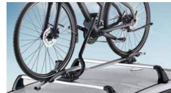
Bike carrier Pro