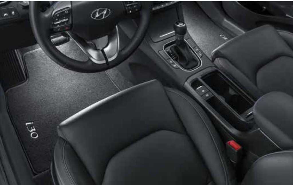
LED footwell illumination, white, first row

Complement the confident and timeless design of your new i30 with your choice of accessories that are both stylish and practical.