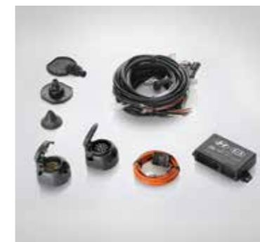
Tow bar wiring kit