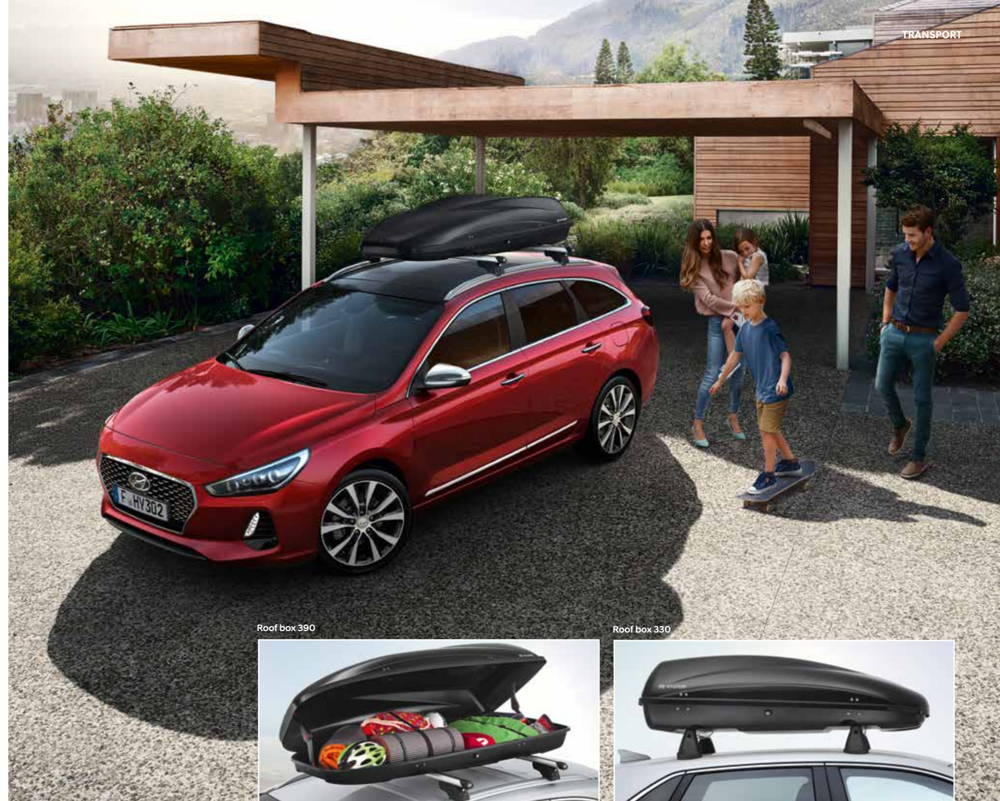
Roof box 390

Dimensions: 195x73.8x36 cm / Volume: 390L / Capacity: up to 75 kg