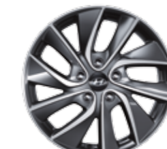
Alloy wheel 17"