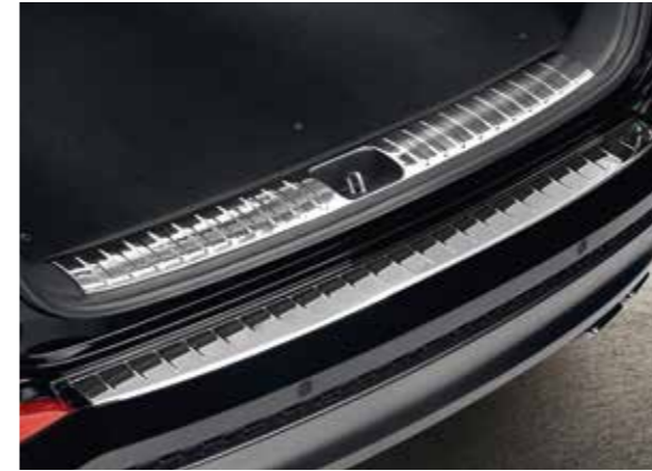
Trunk sill protector & Rear bumper protector (chrome optic)