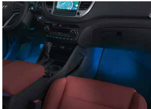
LED footwell illumination, blue, first row