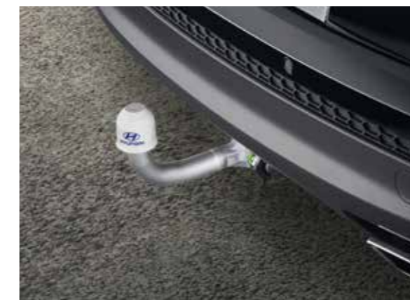
Tow bar, vertical detachable

55622ADB00 (7-pole (vehicle) to 13-pole (trailer/caravan) adaptor)