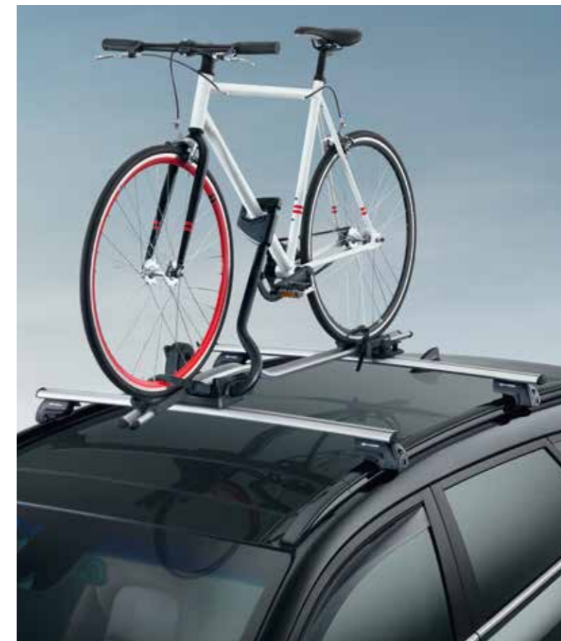
Bike carrier Pro