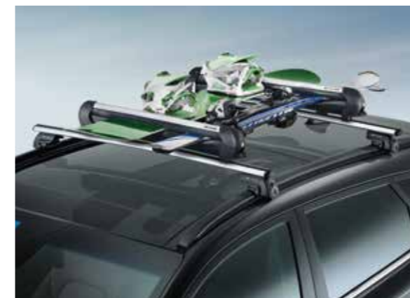
Ski & snowboard carrier 600