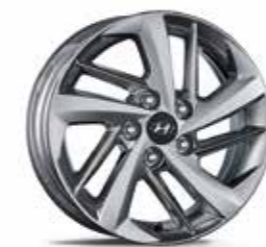
Alloy wheel 16" (52910D7120PAC)