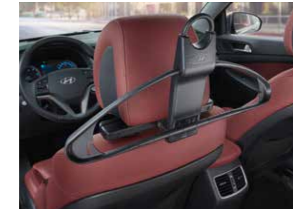
Business suit hanger

These Genuine accessories have been developed to make every journey as pleasant as possible for you and your passengers, whatever the weather.