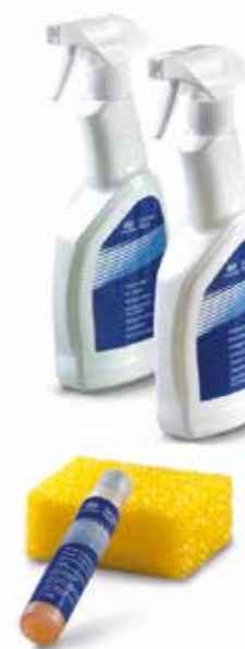
Summer car care kit