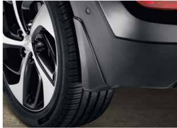
Mud guard kit, rear