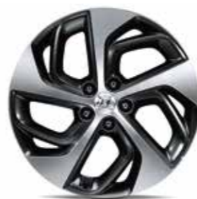
Alloy wheel 19" (52910D7410PAC)