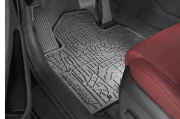
All weather mats

Set of 4 fitted mats that protect the interior from the effects of water, mud and dirt. A Tucson city map and Tucson logo are moulded into the top surface of these durable mats. Matching trunk liner is also available. D7131ADE01 (LHD/MY 16) D7131ADE50 (LHD/MY 19) D7131ADE10 (RHD/MY 16/not shown) D7131ADE60 (RHD/MY 19/not shown)