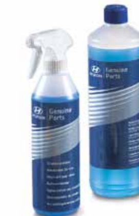
Winter car care kit