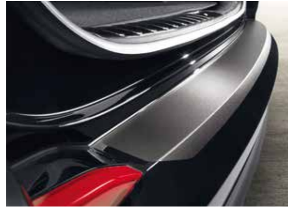
Rear bumper protection foil, black