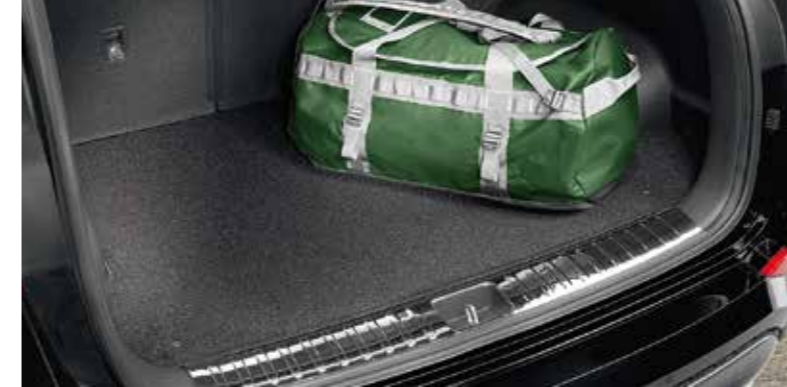
Trunk mat, reversible

Dual function trunk mat that is made specifically for the Tucson. On one side there is the soft cushioning of high-quality velour for sensitive cargo, and a resilient dirt resistant surface for potentially messy loads on the reverse. Can be combined with the foldout bumper flap to protect the surface of the rear bumper. D7120ADE00