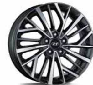
Alloy wheel 18" (52910D7370PAC)