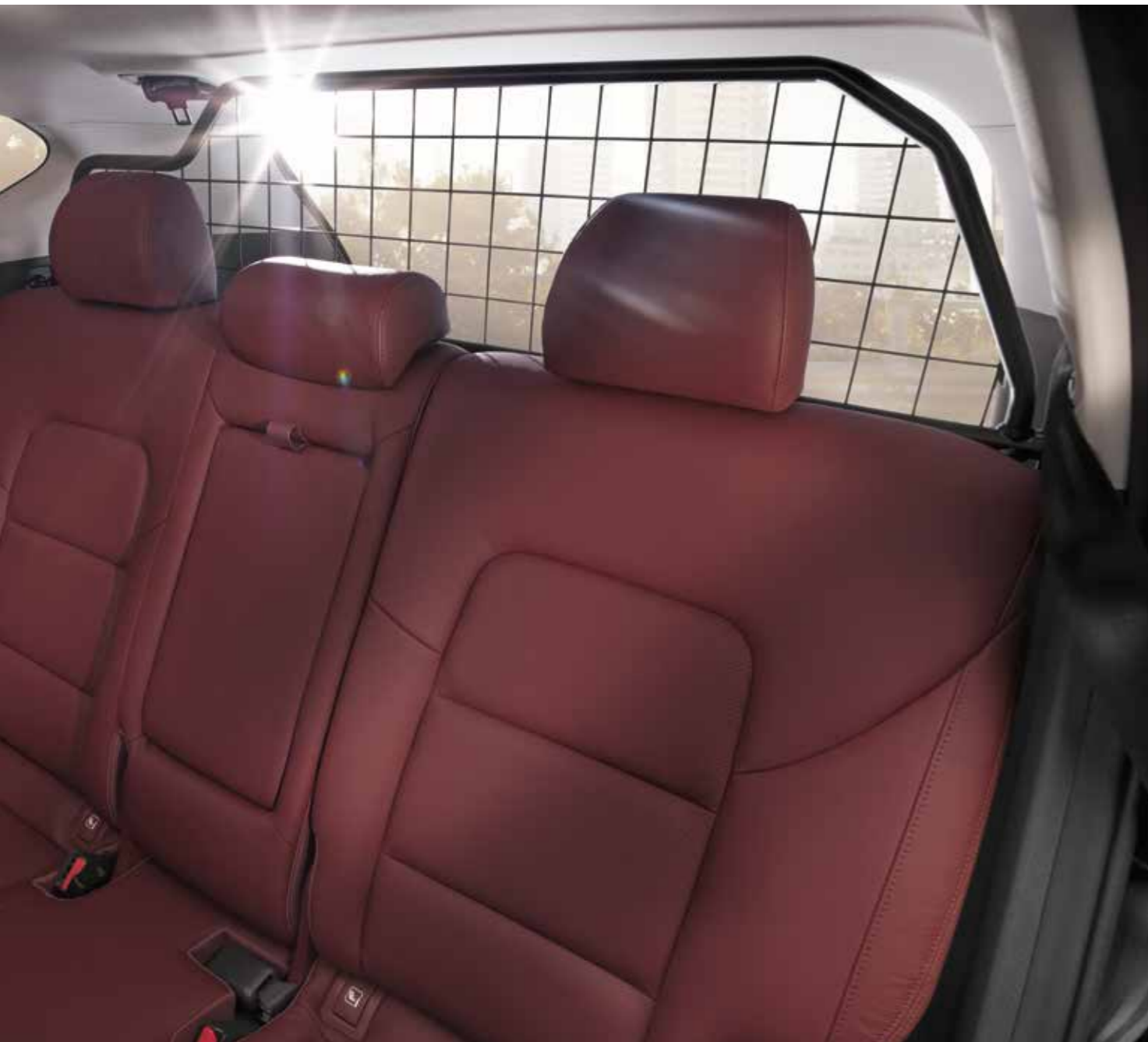
Cargo separator, upper frame