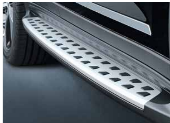
Door mirror caps, chrome optic