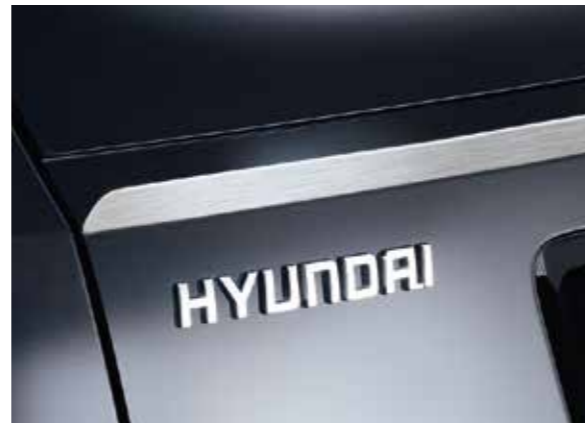
Tailgate trim line, brushed