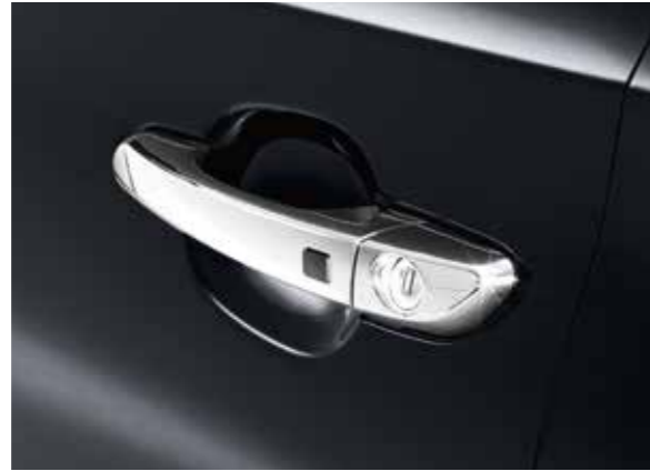
Door handle recess protection foils