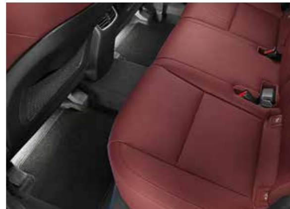
LED footwell illumination, white, second row