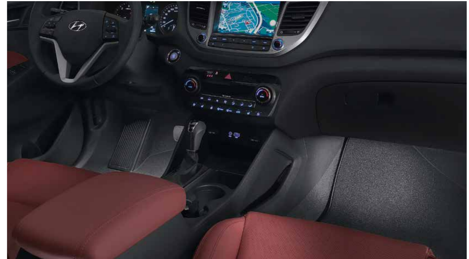
LED footwell illumination, white, first row

2nd row only in combination with 1st row LED lighting.