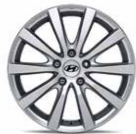
Alloy wheel 17" Halla (A4400ADE01)