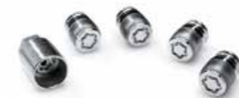
Locking wheel nuts and key

TPMS – Tyre Pressure Monitoring System This Genuine sensor is identical to the factory-fitted sensors thus ensuring optimal functionality and a long life for the sensor battery. 52933C1100 (one sensor/not shown)