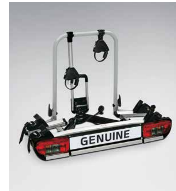
Bike carrier for all tow bars

All Hyundai Tucson Genuine tow bars are corrosion resistant, certified by ISO 9227NSS salt spray test, and comply with OE Car Loading Standard (CARLOS) Trailer Coupling (TC) and Bike Carrier (BC) requirements.