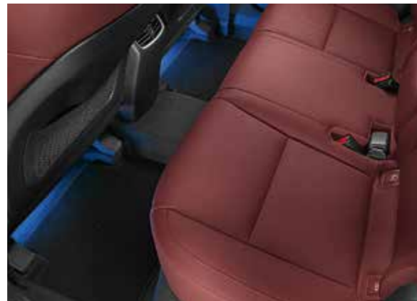
LED footwell illumination, blue, second row