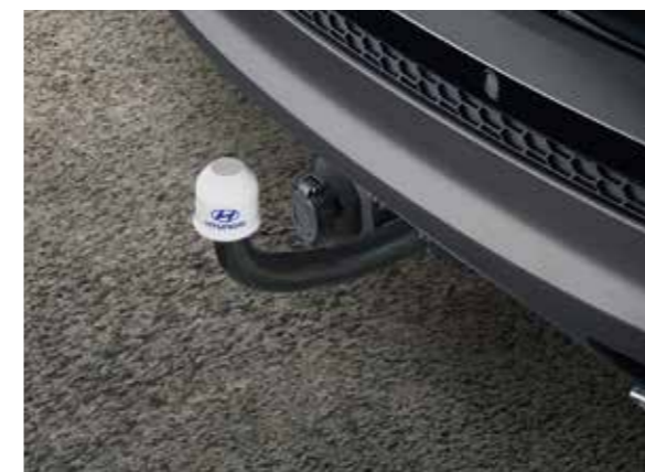
Tow bar, fixed