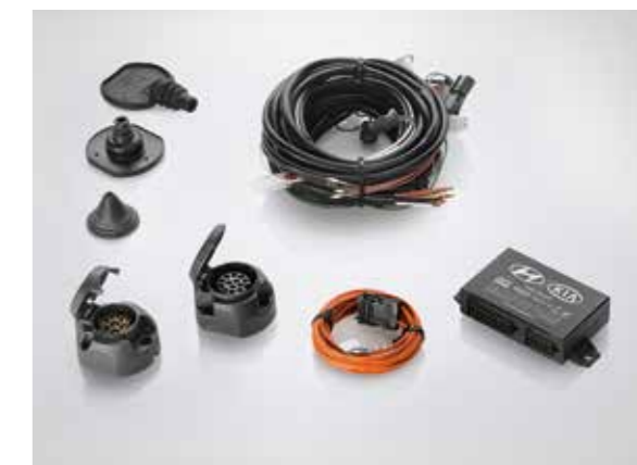
Tow bar wiring kit