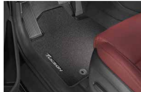
Textile floor mats, velour