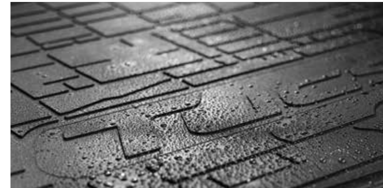
Trunk liner (close-up)