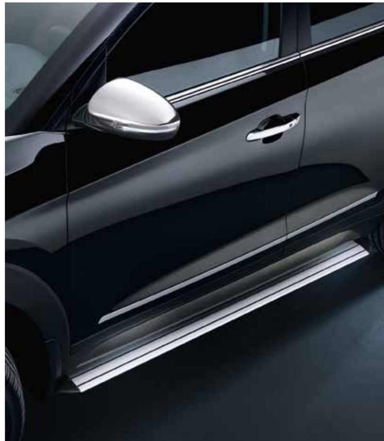
Door mirror caps, chrome optic