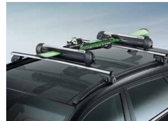
Ski & snowboard carrier 400

99701ADE90 (U-mount adapter kit for steel cross bars)