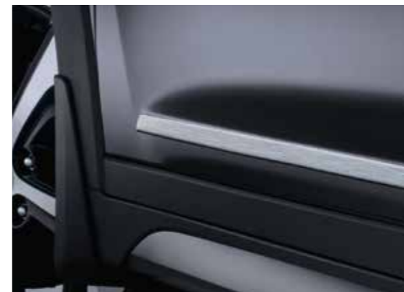
Side trim lines, brushed