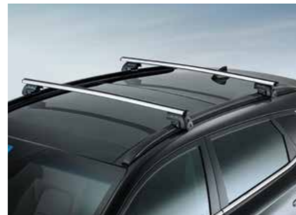
Cross bars, aluminium