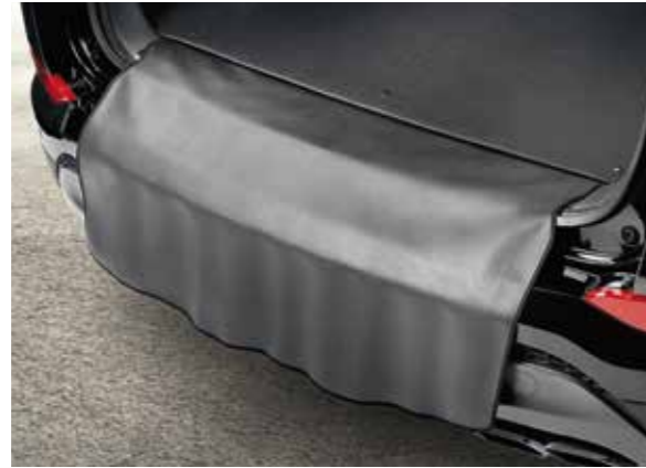
Bumper flap for trunk mat