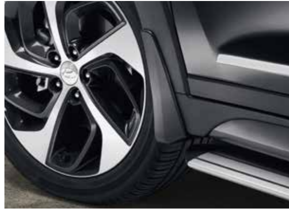
Mud guard kit, front