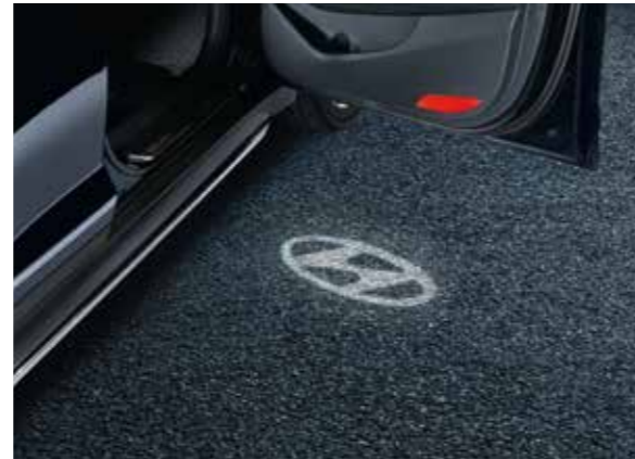
LED door projectors, Hyundai logo