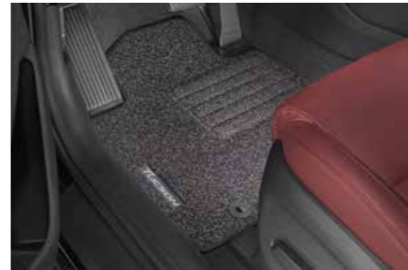
Textile floor mats, standard