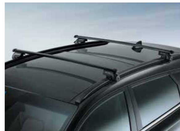
Cross bars, steel