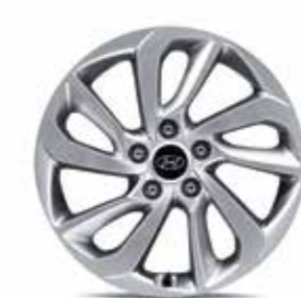
Alloy wheel 17" (52910D7210PAC)