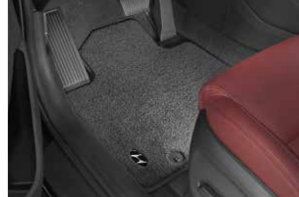
Textile floor mats, premium

Tailor-made to fit the foot-wells perfectly, these luxurious thick velour mats are held in place with standard fixing points and anti-slip backing. Set of 4, the front mats are embellished with a tasteful black and silver metal cast Hyundai logo. D7144ADE00 (LHD/MY 16) D7144ADE10 (RHD/MY 16/not shown)