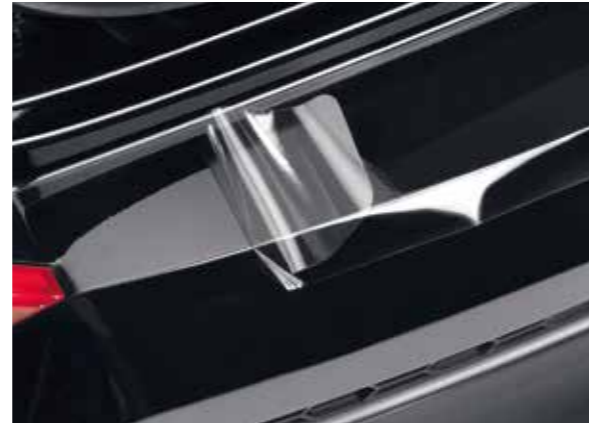
Rear bumper protection foil, transparent