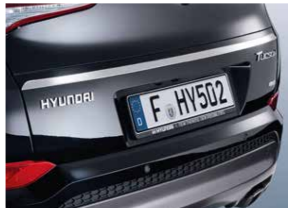
Tailgate trim line, chrome optic