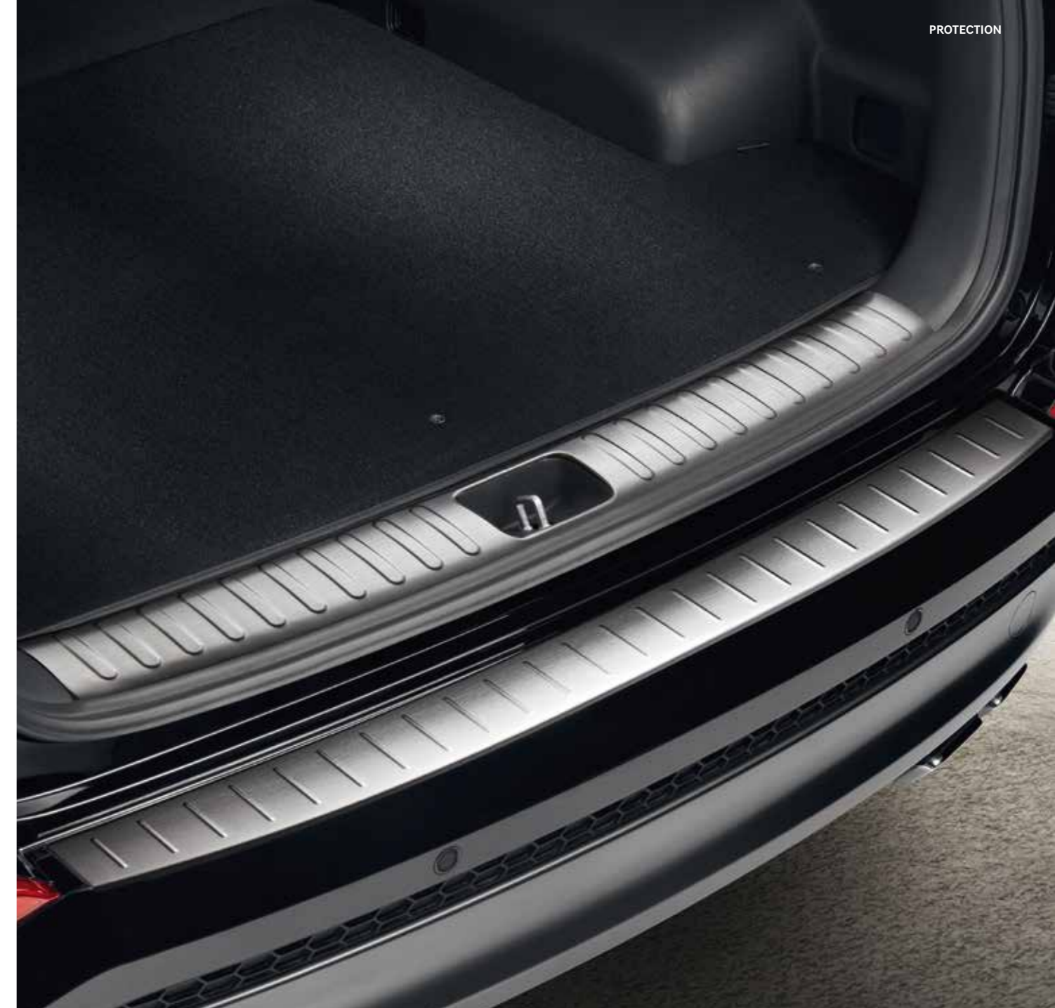
Trunk sill protector & Rear bumper protector (brushed)