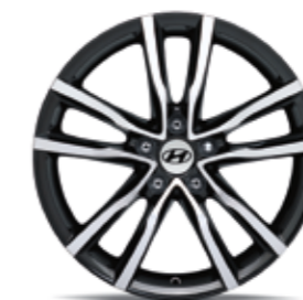
Alloy wheel 18" Ulsan (D7400ADE02)