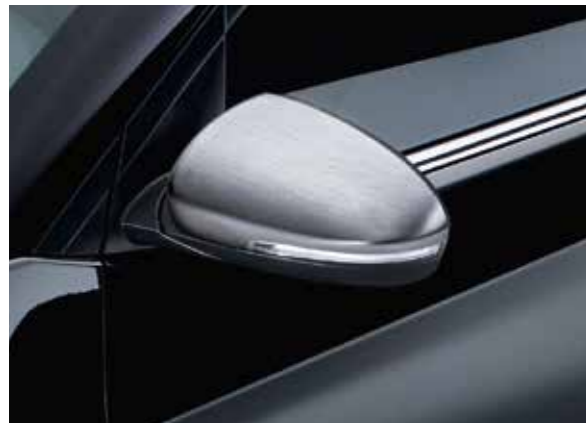
Door mirror caps, brushed