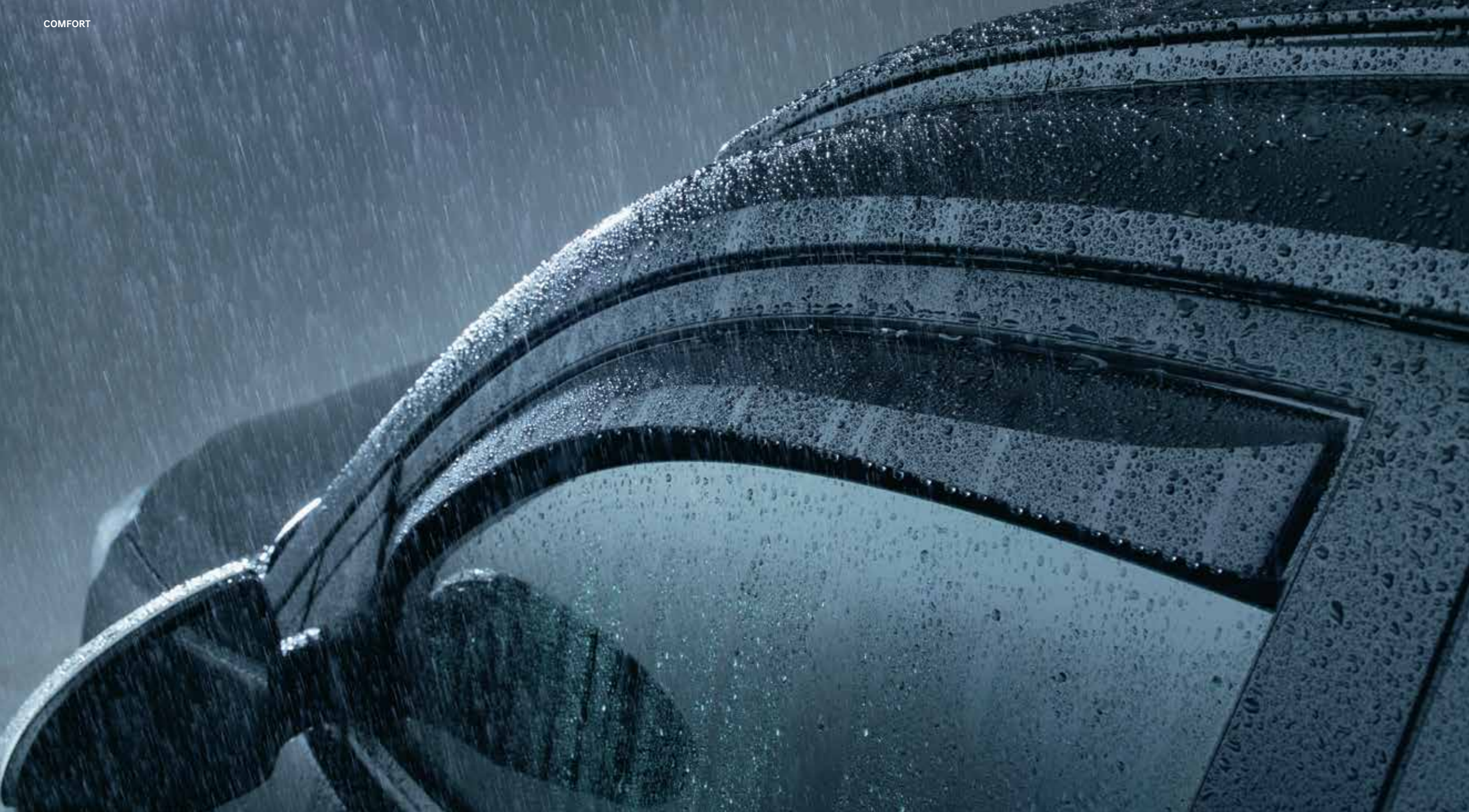
Wind deflectors, front