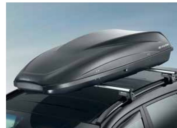
Roof box 390