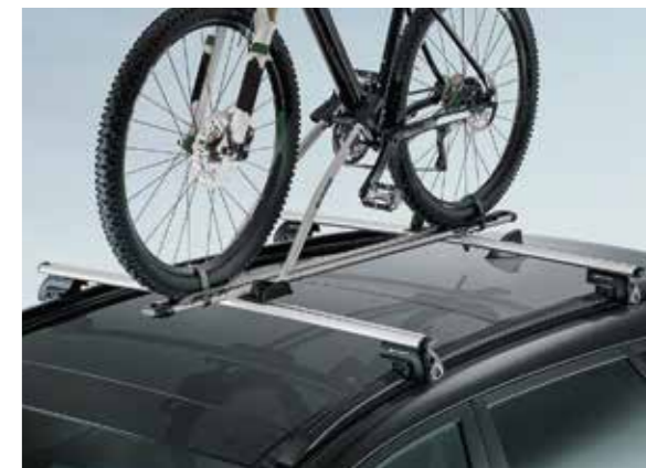
Bike carrier Active

99730ADE00 (dimensions: 195x73.8x36cm/390L)