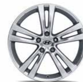
Alloy wheel 18" Busan (A4400ADE02)