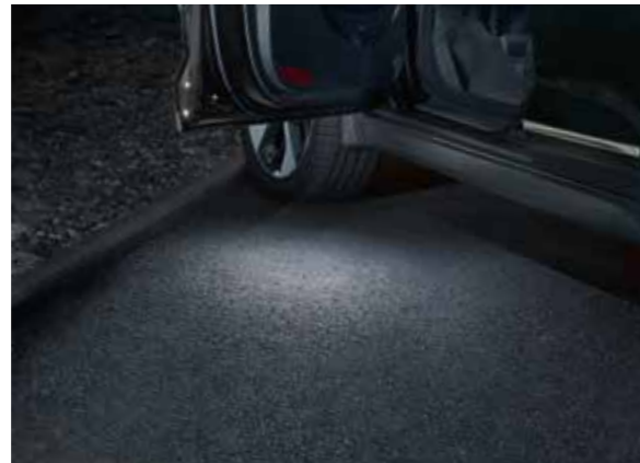
LED puddle lights