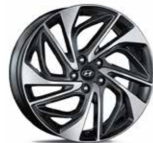
Alloy wheel 19" (52910D7470PAC)

Designed to enhance the athletic looks of the Tucson, all our genuine wheels are engineered to the same demanding standards as the car itself.