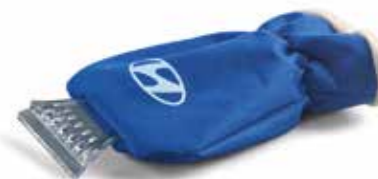
Ice scraper with glove