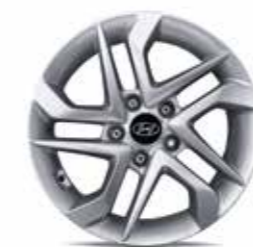
Alloy wheel 16" (52910D7110PAC)