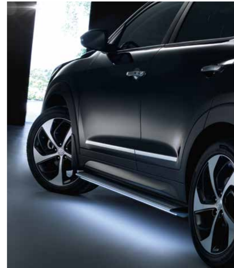
Side trim lines, chrome optic & Side steps, illuminated