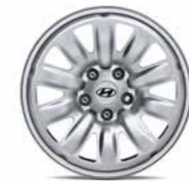
Steel wheel 17" (D7401ADE00)