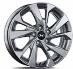
Alloy wheel 17" (52910D7220PAC)